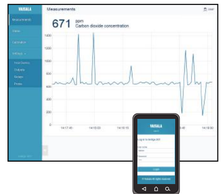
Wireless Configuration Interface Example (Desktop and Mobile Views)

The surface of the Indigo 200 enclosure is smooth, which makes it easy to clean. It is also resistant to dust and most chemicals, such as, H 2 O 2 and alcohol-based cleaning agents.