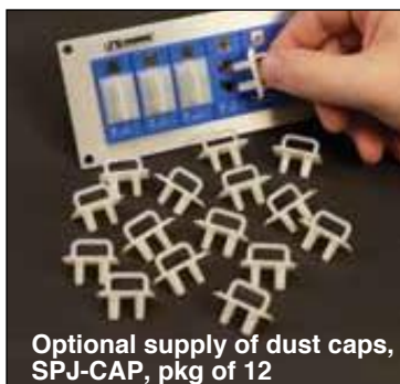
Optional supply of dust caps, SPJ-CAP, pkg of 12