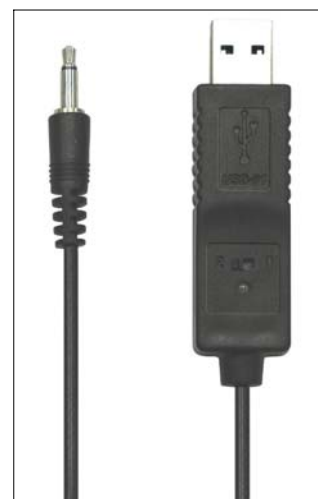
USB cable, Model : USB-01